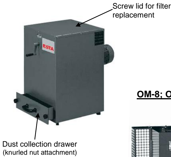
Bag filter on TK models

TK-4; TK-6 TK-H; TK-2.2 (internal motor)